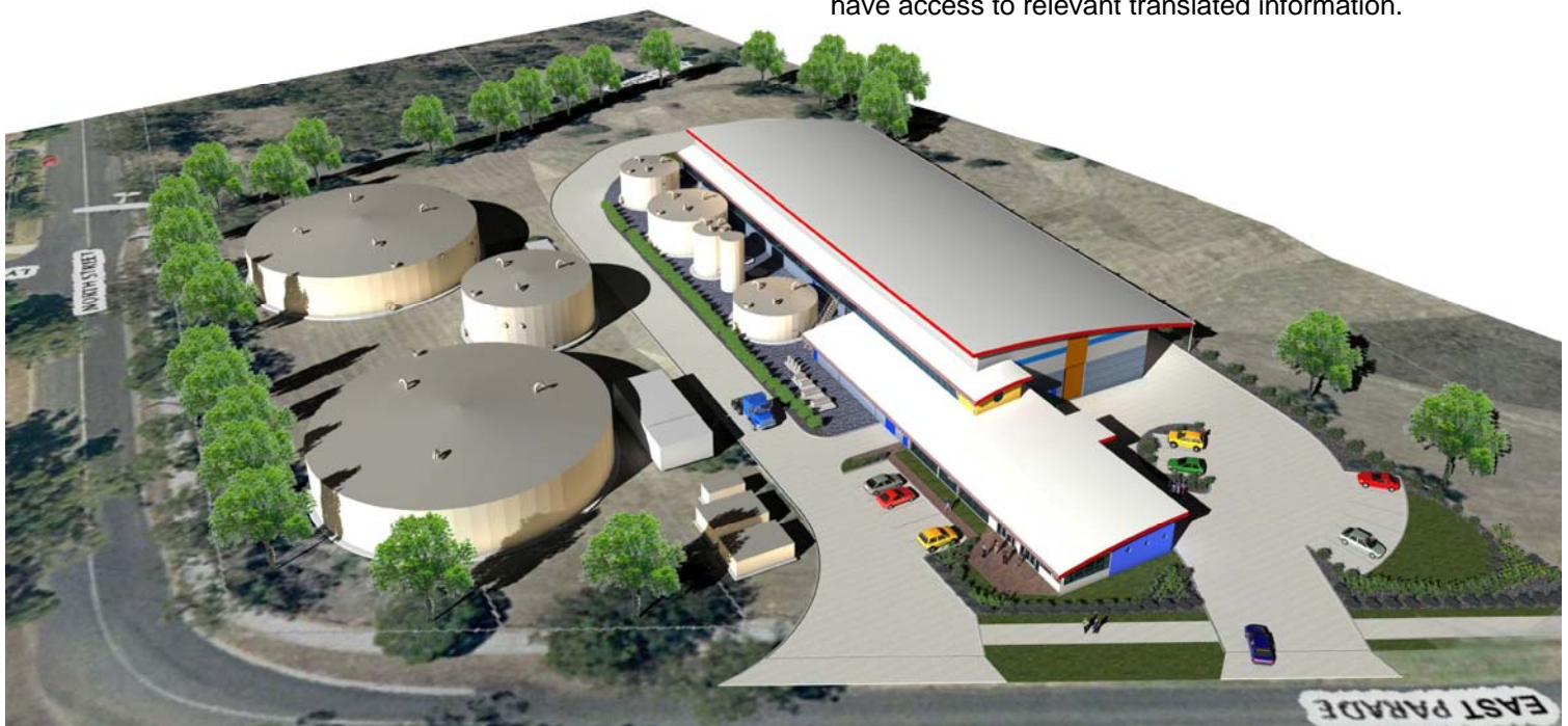
An artists impression of the concept design for the recycling water plant at Fairfield

Jemena will work with interpreters to ensure that non-English speaking communities affected by the scheme will have access to relevant translated information.