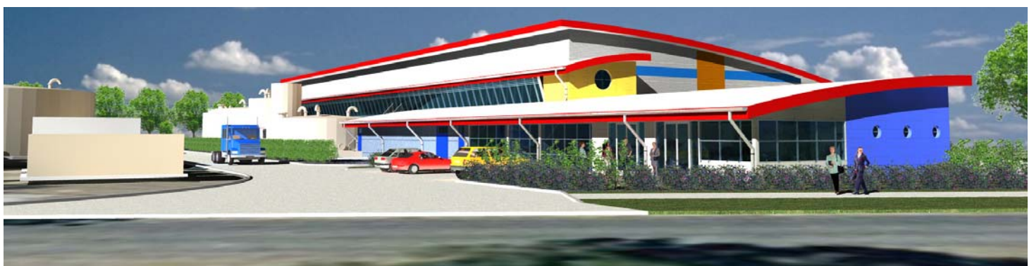
An artists impression of the concept design for the recycling water plant at Fairfield (sourced from Veolia Water)

Community Contact Line: 1800 118 835 Email: rosehill@jemena.com.au Website: rosehillrecycledwaterscheme.com.au Post: Rosehill Recycled Water Scheme Jemena Asset Management PO Box 6507, Silverwater NSW 2128